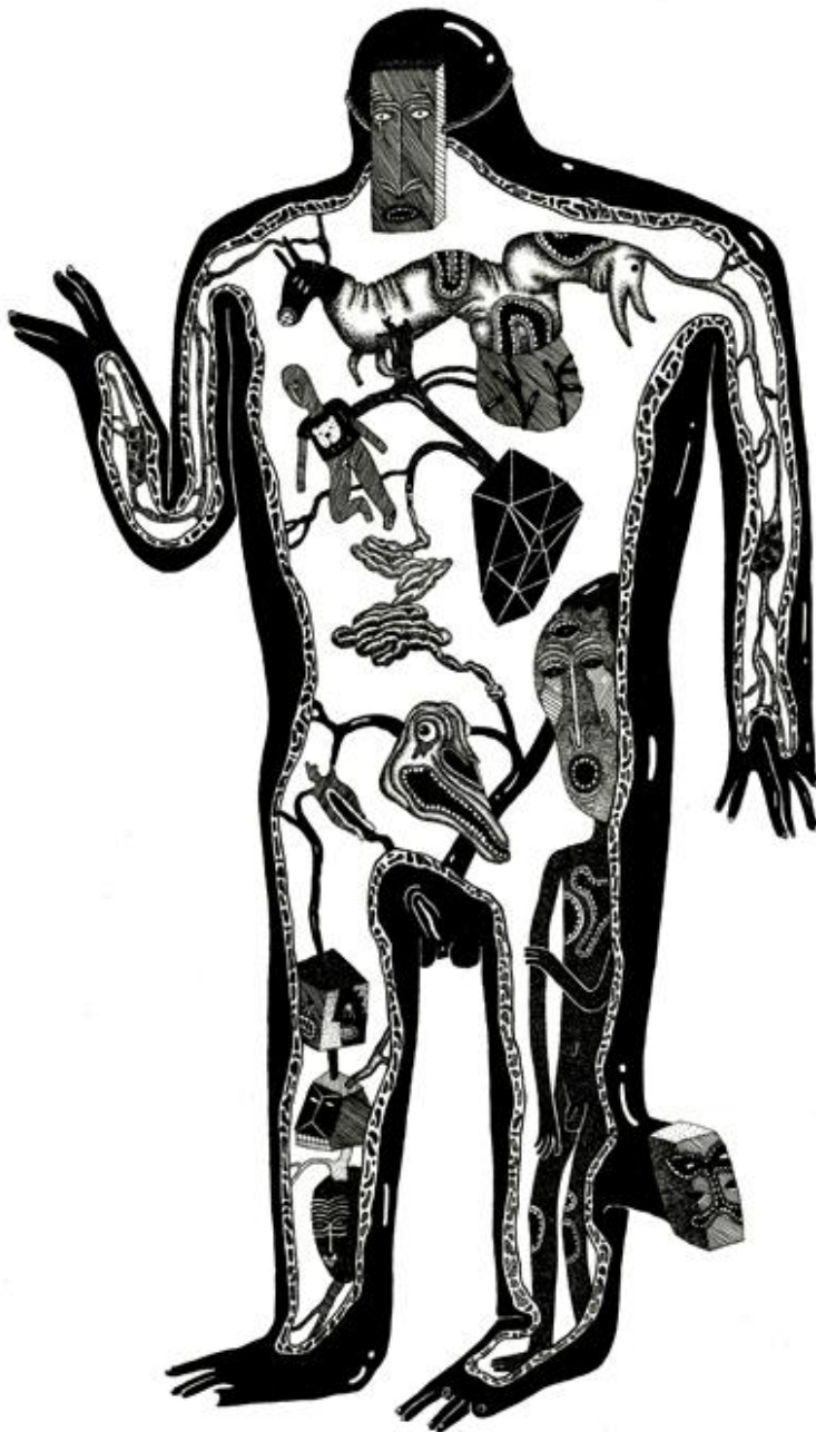
"Body", drawing, digital print on paper, 43/24 cm, 2011

Born in 1989 in Sofia, Bulgaria, where he lives and works at present. He has interest in urban culture, social relationships and future of the planet. Main subject in his works is the present man. His style has laconic form and delicate line of irony and political sarcasm. Pramatarov presented his art in international forum for contemporary graphics, curatorial projects and festivals in Bulgaria, Belgium, South Korea, Italy, Spain etc. He works in the field of graphics, illustration, street art, paper objects and comics and he has international prizes for graphics and illustration. Bulart Gallery presented the work "Body" in the competition for young artists in Kunststart 2012 – "The Glocal Rookie in the Year".