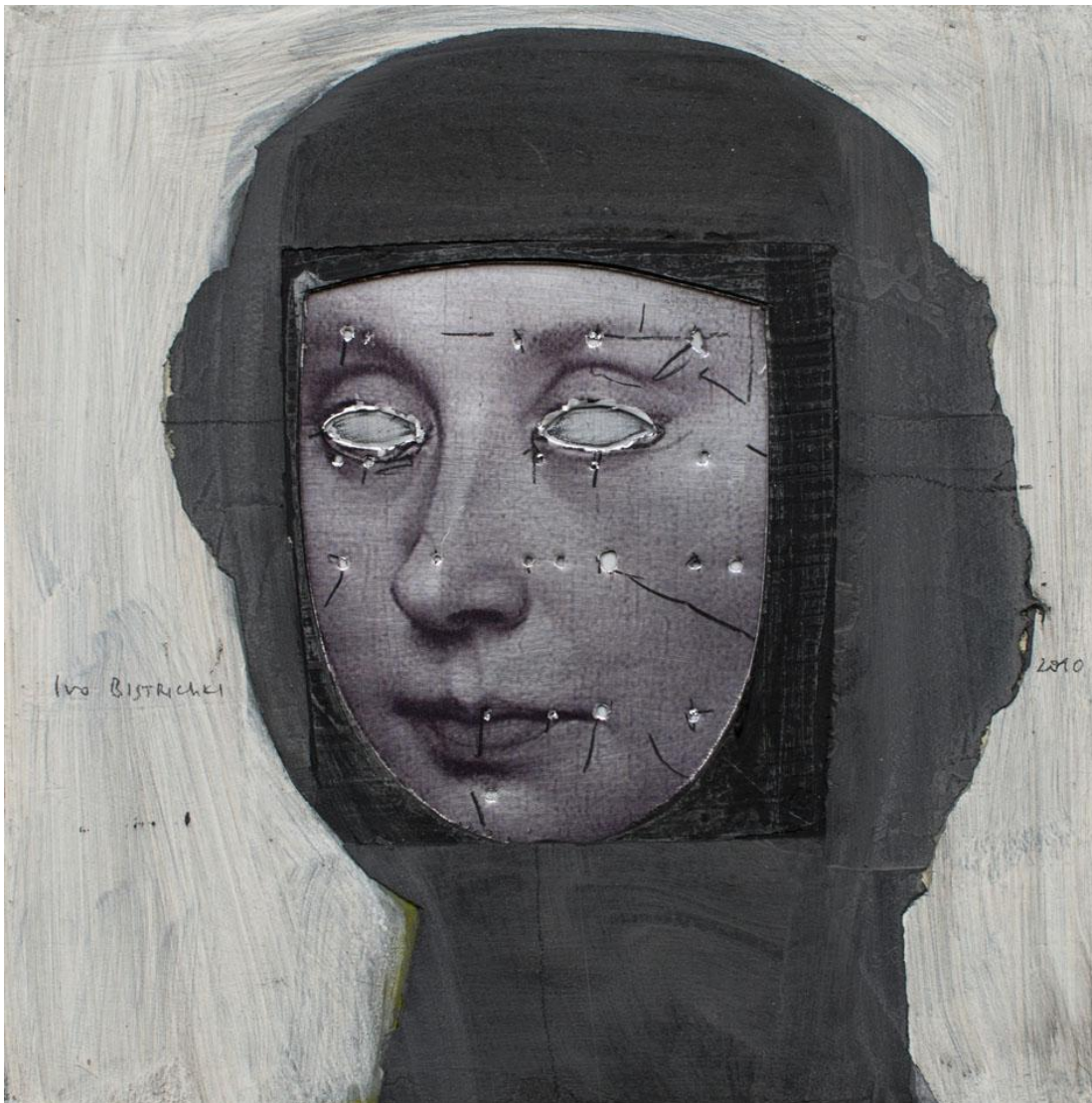
“Portrait deconstructed II” , digital printing on offset plates, intervention, clay, acrylic, canvas, 35x25 cm 2010