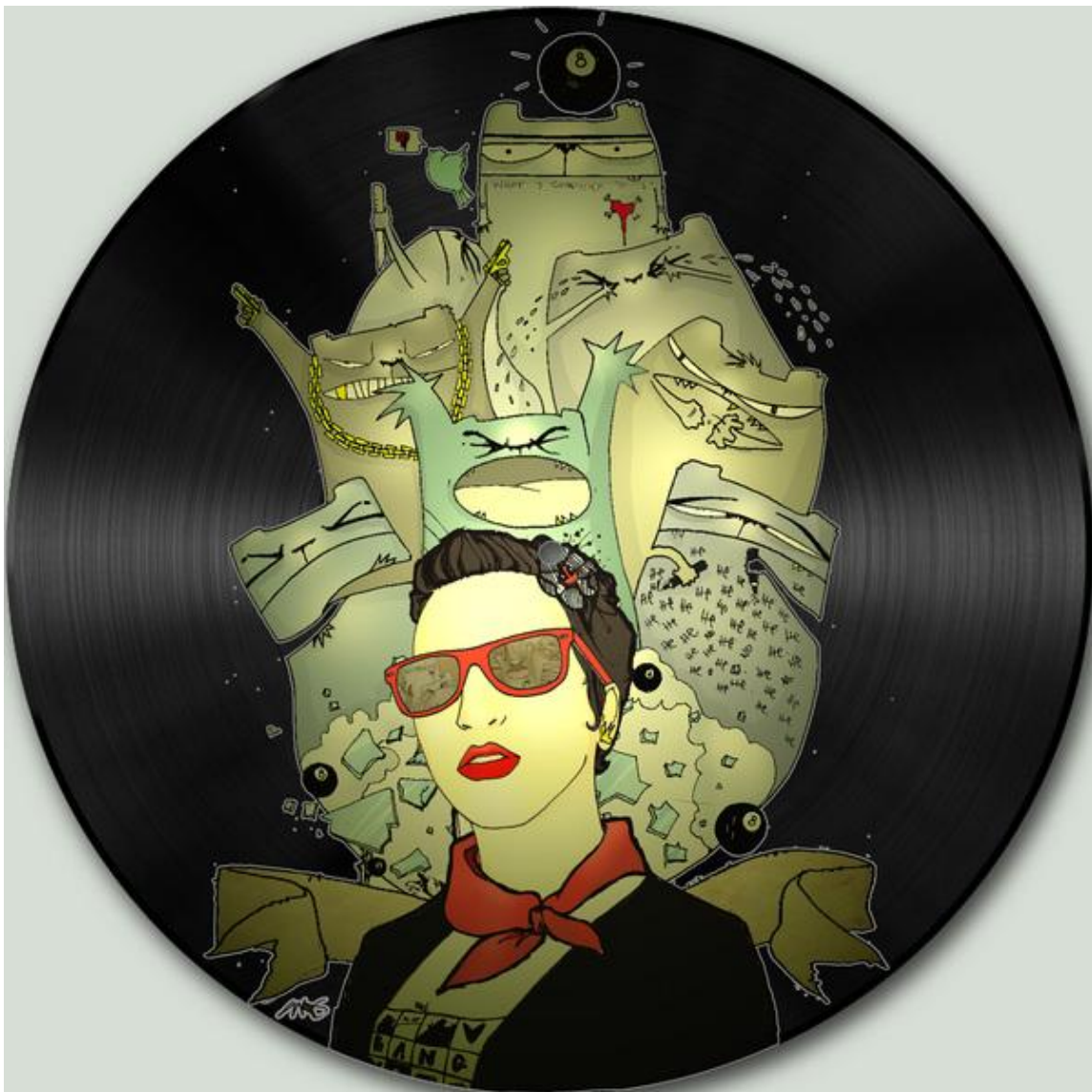
“Record the street” series, digital print on vinyl record, 30 cm, E/A, 2011

Born in 1983 in Varna, Bulgaria. Lives and works in Sofia, Bulgaria. She works in the field of storyboard, illustration, 2D animation, comics drawing and graphic design. The focus of her artistic interest is urban life-style and its heroes. She uses old Bulgarian vinyl records for base and prints her stories on them. She is also interested in role of the present woman. She uses pin-up models and vintage codes to express her discovery. She has taken participation in curatorial projects and festivals dedicated to urban art. She realized several solo exhibitions in Varna and Sofia and she was a curator of street art projects in 1908 gallery in Sofia.