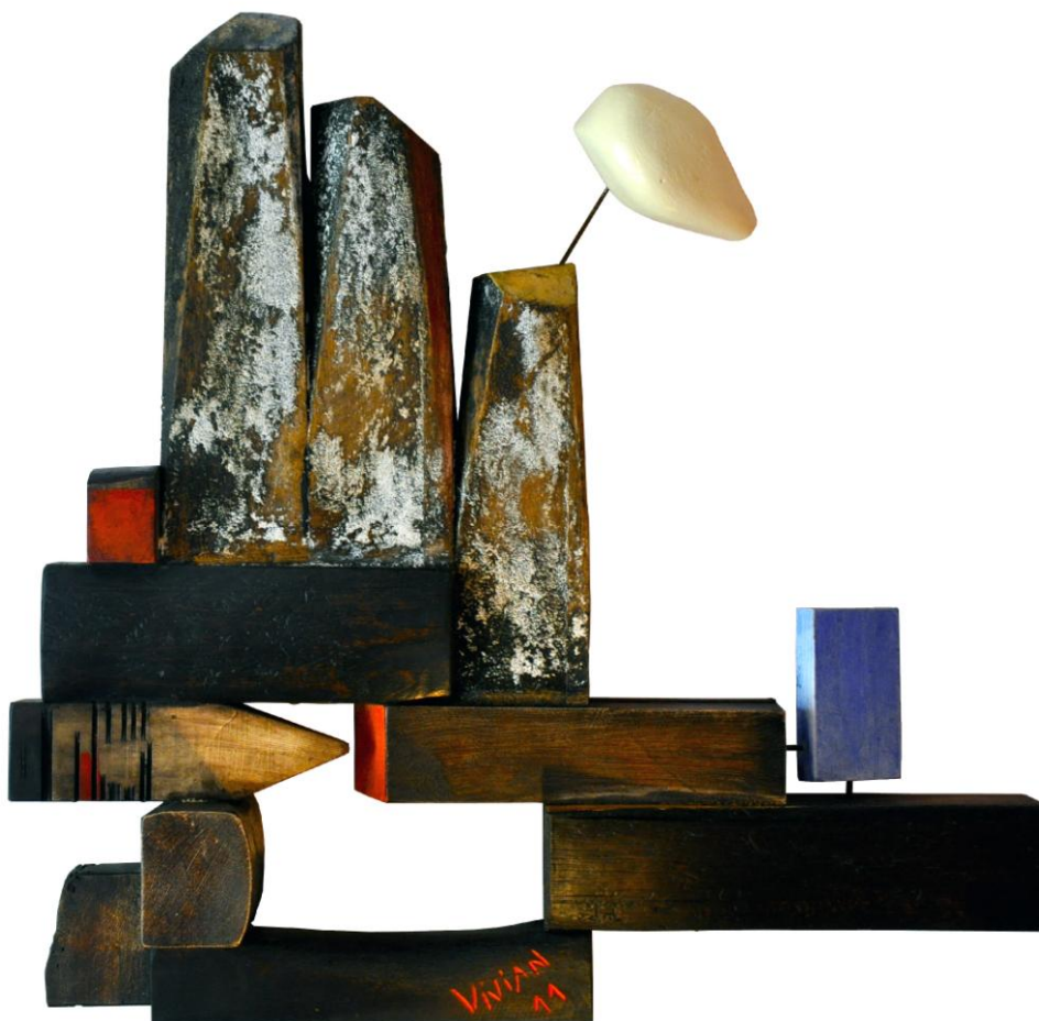
“Verticale – Orizzontale”, sculpture object by wood, 70x70x14 cm, 2011