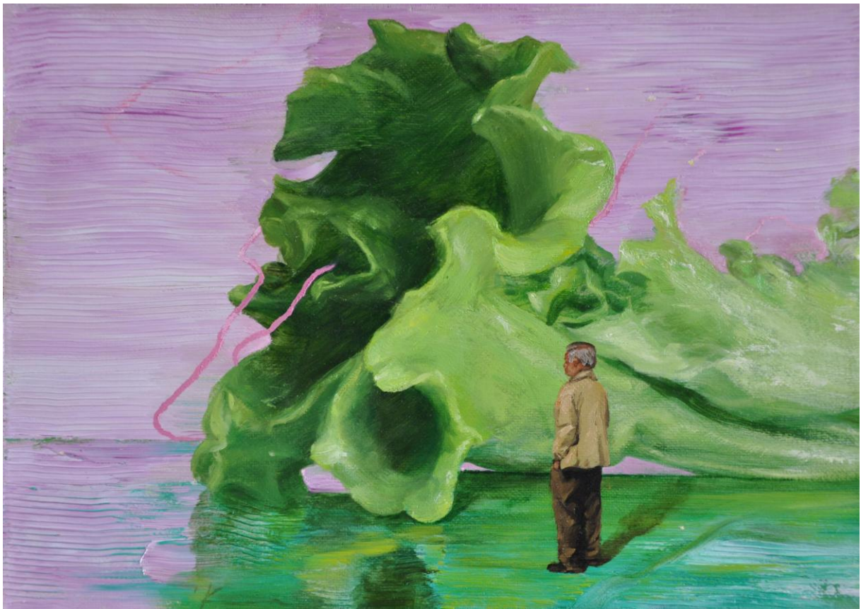
“Gramophone”, painting, 25x35cm, 2011