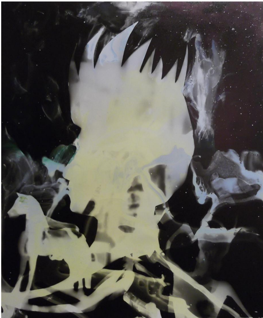
“Composition “, photogram, E/A, 24x34 cm, 2011