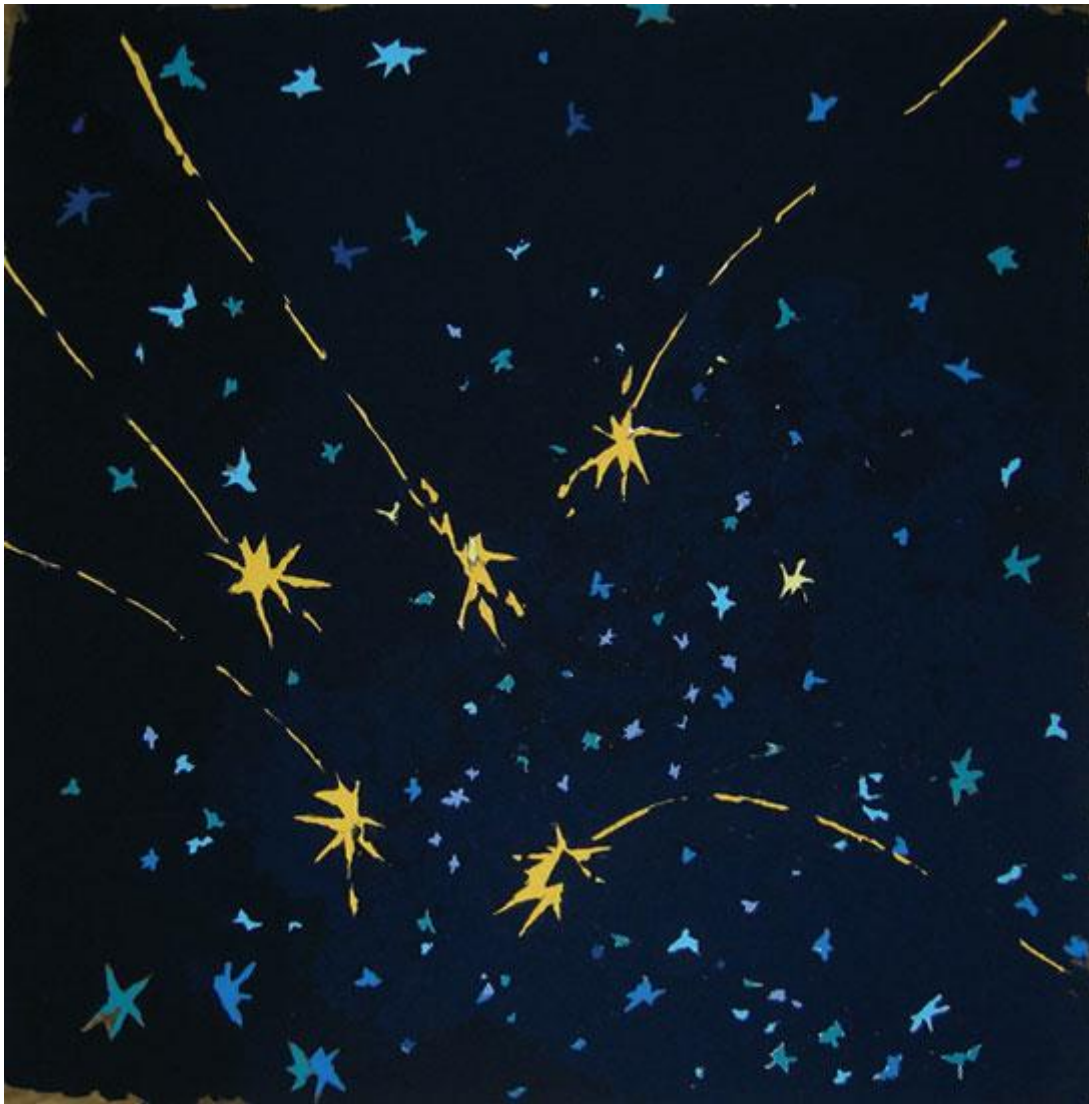
“The freedom and participation”, acryl on canvas, 100x100x4.5 cm, 2007

Born in 1957 in Trento, Italy where he lives and works. He has interest in abstraction and his creations have symbolic and poetic elements. He works in the field of painting and sculpture with glass. His art is presented in solo and collective exhibitions in Italy and Austria. He is a member of FIDA – Italian Association of contemporary artists, branch Trento.