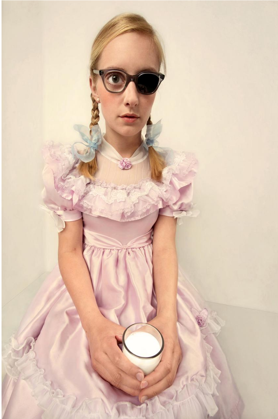
“Milk”, photography, edition 2/5, 2010

Born in 1971 in Varna, Bulgaria. Lives in Germany since 1990. She works on the field of contemporary photography. Her artistic interests are focused in present life. She manipulates personages and interacts with dogmatic concept of reality. Her works have surreal character and ironic elements with a frequent usage of classical realistic compositions. Her works have been presented on international art fairs, festivals and curatorial projects in Bulgaria, Germany, UK, Italy, Greece and Qatar. She is a winner of international and national awards for photography.